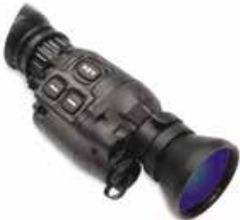
Insight MTM with 3x adapter