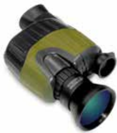
2x adapter with X200