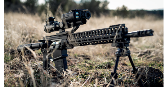
Integrated with ID™ Gi™ Riflescope