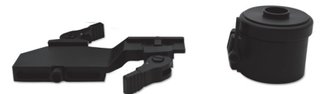
Picatinny mount and RUSAN scope mount